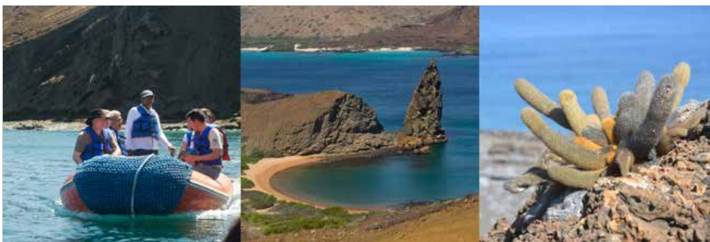
Pinnacle Rock, Bartholomew Island

You will head to Bartholomew Island where the famous Pinnacle Rock is found. Bartholomew consists of an extinct volcano with a variety of red, orange, black and even green volcanic formations. We will take a trail of stairs to the summit of the volcano (about 30 or 40 minutes) where you will enjoy one of the best views of the islands! A beautiful beach surrounded by the only vegetation is perfect for snorkeling where you may even see and swim with Galapagos penguins.