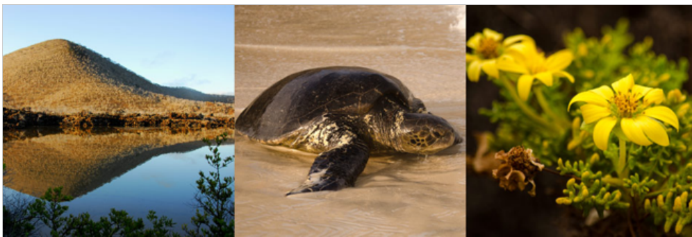
Cormorant Point, Floreana Island

Cormorant Point hosts a large flamingo lagoon where other birds such as common stilts and white-cheeked pintails can also be seen. The beaches on this island are distinct: The Green Beach is named so due to its green color, which comes from a high percentage of olivine crystals in the sand, and the Flour Sand Beach is composed of white coral.