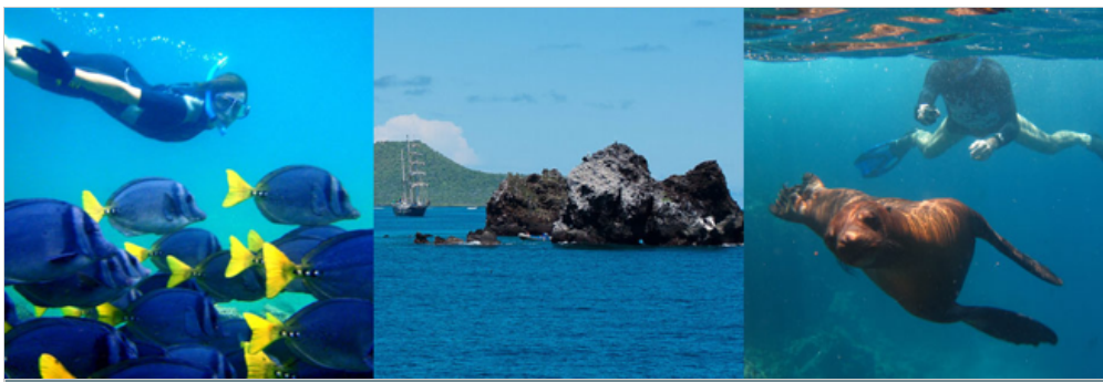
Devil's Crown, Floreana Island