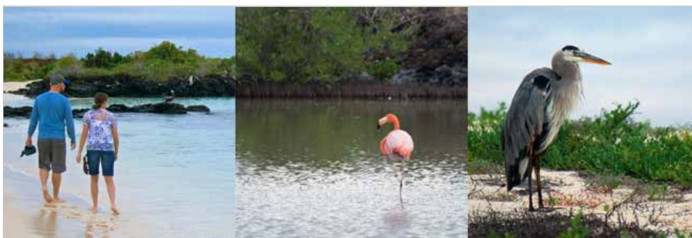
Bachas Beach, Santa Cruz Island

Bachas Beach is located on the north shore of Santa Cruz and is a beach for swimming. One of the few remnants of the U.S. World War II presence in the Galapagos, a floating pier, can be seen here. You may see flamingos, Sally Lightfoot crabs, hermit crabs, black-necked stilts, and whimbrels. Sea turtles also nest on the beach.