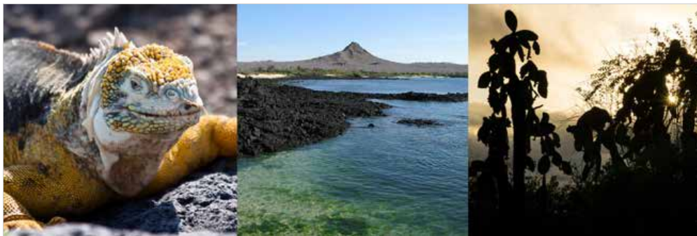
Dragon Hill, Santa Cruz Island

Situated on Santa Cruz Island, Dragon Hill is one of the newest visitor sites accessible to tourists in the Galapagos Islands. One of the lengthier Galapagos walking trails will lead visitors along a beach and up a trail to the lagoon lookout where bright flamingos, pintail ducks, and land iguanas can be spotted.